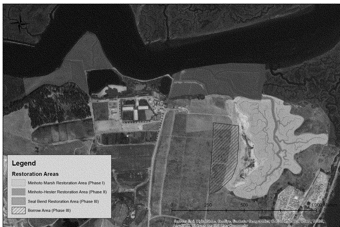
Figure 2. Map depicting the location of each restoration site for the project for the proposed and previous phases