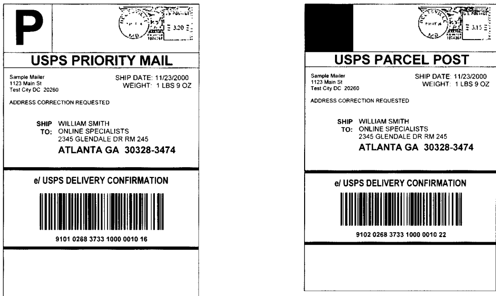
Samples of Proposed Standard Shipping Label for Priority Mail & Parcel Post