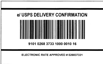
Sample of Modifications to Electronic Option Delivery Confirmation Labels

Although exempt from the notice and comment requirements of the Administrative Procedure Act (5 U.S.C. 553(b), (c)) regarding proposed rulemaking by 39 U.S.C. 410(a), the Postal Service invites comments on the following proposed revisions of the DMM, incorporated by reference in the Code of Federal Regulations. See 39 CFR Part 111.