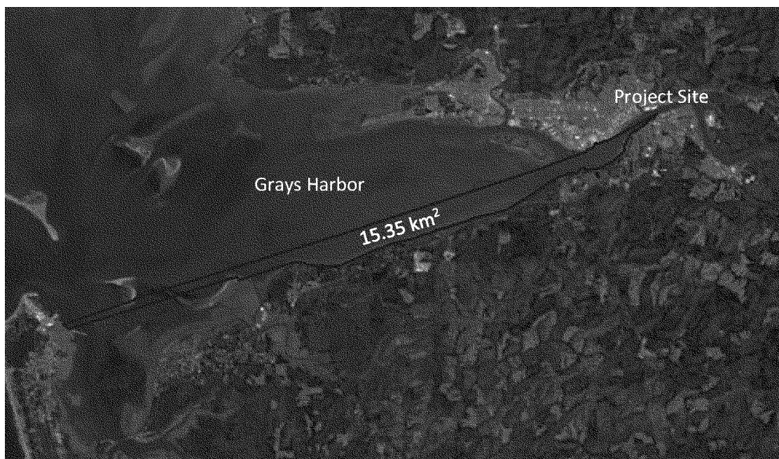
Figure 2. Estimated Area to be Ensonified to Level B Harassment Threshold for 48-inch Steel Piles