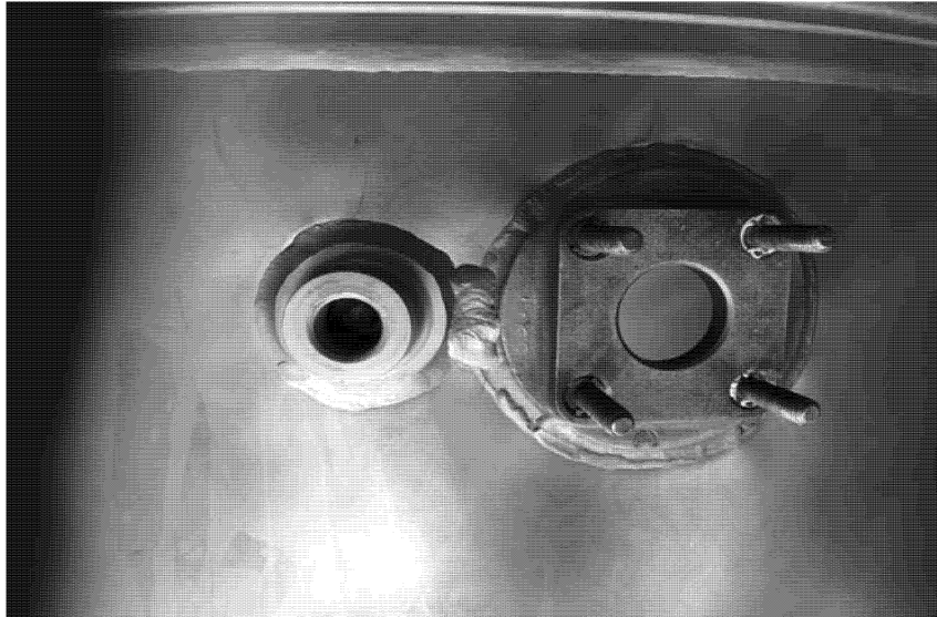
Figure 2 to Paragraph (h) of this AD. Combustion Chamber Case Assembly with One-Piece Bleed Pad with P3 Boss